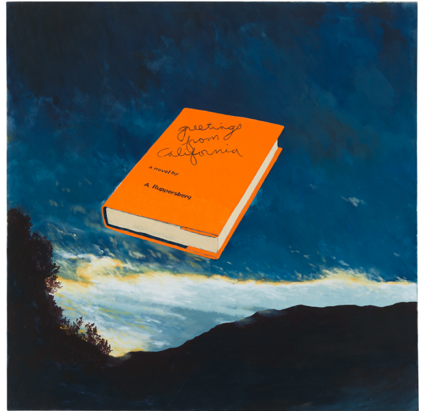
Allen Ruppersberg, Greetings from California , 1972.

Ruppersberg: It depends on what you call periphery, but being anonymous, I think, is