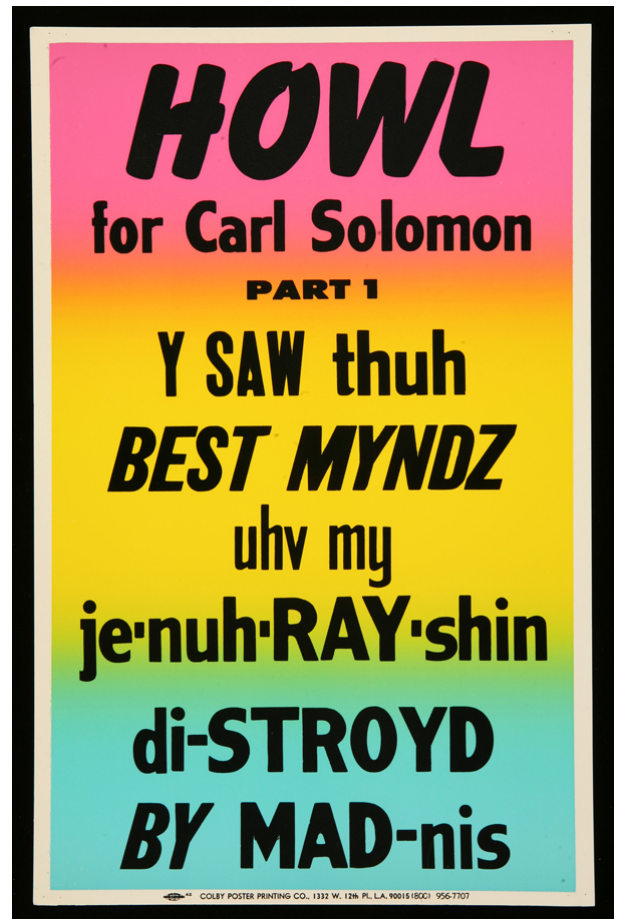
Allen Ruppersberg, The Singing Posters: Allen Ginsberg's Howl by Allen Ruppersberg (Part 1 & 2) , 2003, (detail). Printed posters, dimensions variable. Courtesy the artist and Greene Naftali, New York.

Ruppersberg: And I am in my early Conceptual pieces—artists at that time tended to use themselves because it was the easiest ... you were always available. I appeared in a lot of these early photo pieces, but obviously it's not me. It's somebody standing there, but they don't know if it's me or not, unless they happen to know me then they would recognize me. But I stopped doing it after a while.