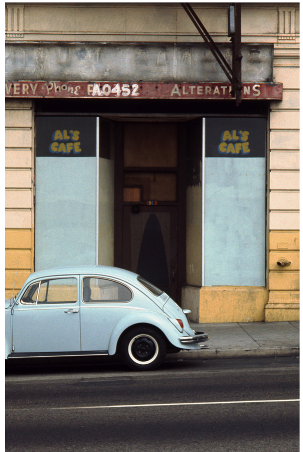
Street view of Allen Ruppertsberg's site-specific project Al's Café , 1969. Courtesy the artist. Photo: Gary Krueger.